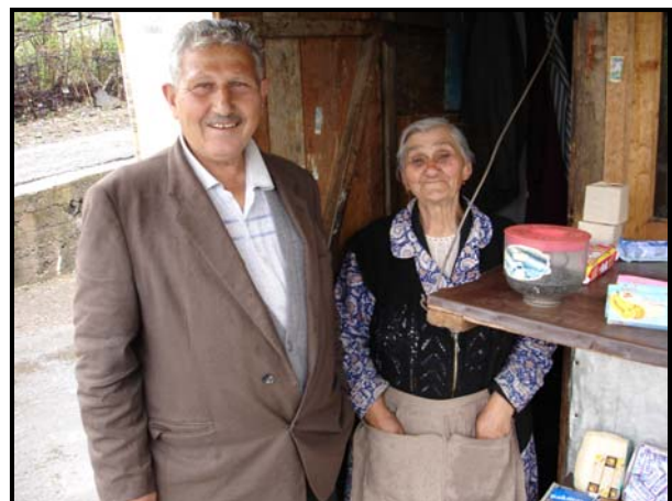
Local shop owners He serves up a mean vodka at 8am.